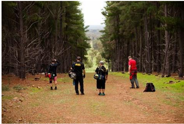
View from the top of "Deep Throw", Pine Lines, Gidgegannup

Perth Open 2016 (17-19 th June, 60 players)