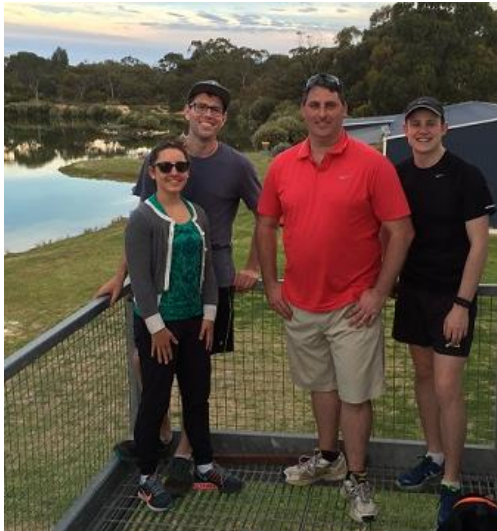
The newly elected board Left-Right